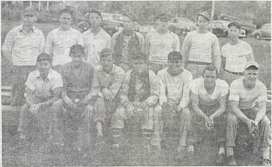
Meet the champions of the Interdepartmental Baseball League, the hustling Control team. The Machine Room was right on the neck of the champs the latter part of the season, but was unable to knock the Control nine from the top of the standings.