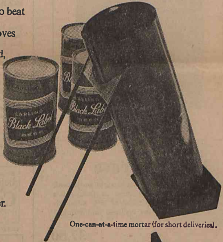
One-can-at-a-time mortar (for short deliveries).