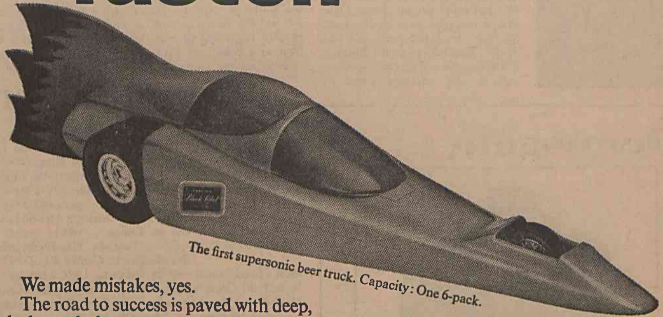
The first supersonic beer truck. Capacity: One 6-pack.

We made mistakes, yes. The road to success is paved with deep, dark manholes.