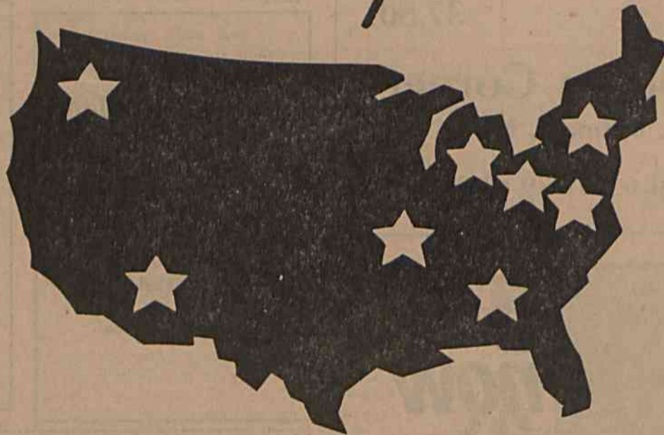
The answer: 8 breweries around the country. A big-time beer nearby.

CARLING BREWING COMPANY, CLEVELAND, OHIO.