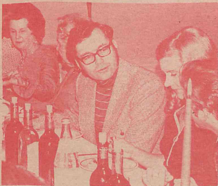
Students, faculty and guests enjoy the bon cuisine et vin of France at a dinner sponsored and produced by french speaking students.