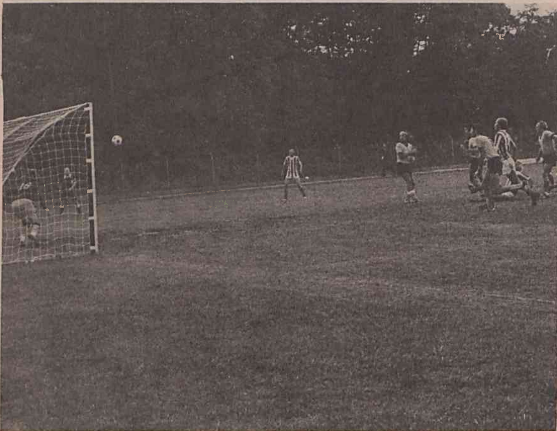
UNCA's third goal in soccer victory over Winthrop College.