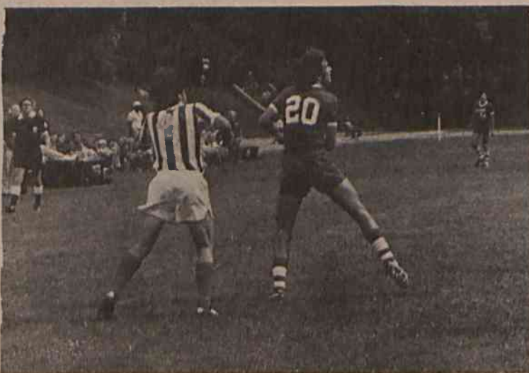
Action in first soccer game of season