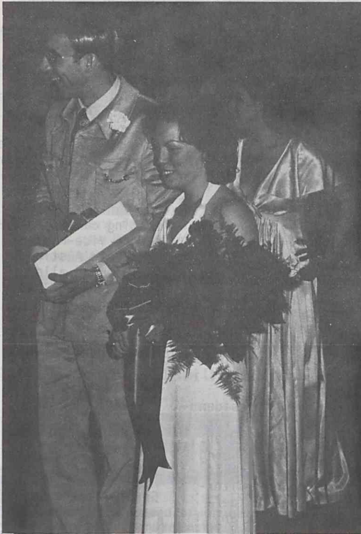
RIDGERUNNER