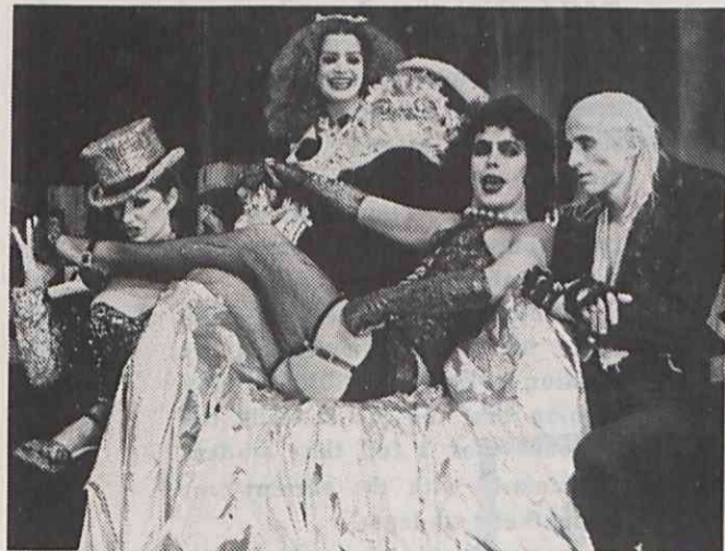
Columbia, Magenta, Frankfurter, and Riff Raff sing Sweet Transvestite from Transsexual Transylvania