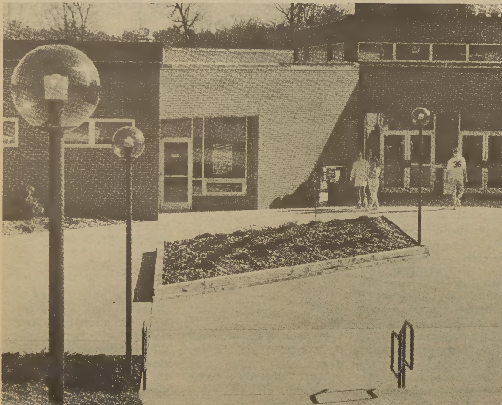
What's in a name?: The Student Center ...