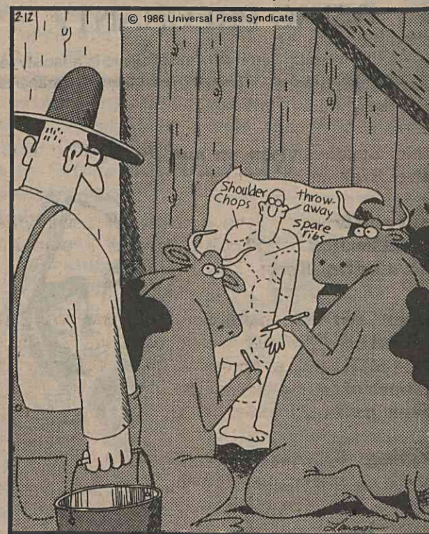
Farmer Brown froze in his tracks; the cows stared wide-eyed back at him. Somewhere, off in the distance, a dog barked.