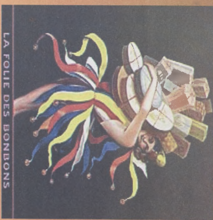
LA FOLIE DES BONBONS

Live music Gourmet desserts Brunch & lunch Chocolate martinis Crafts Massage