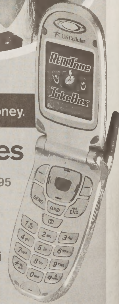
LG VX6100 Camera Phone