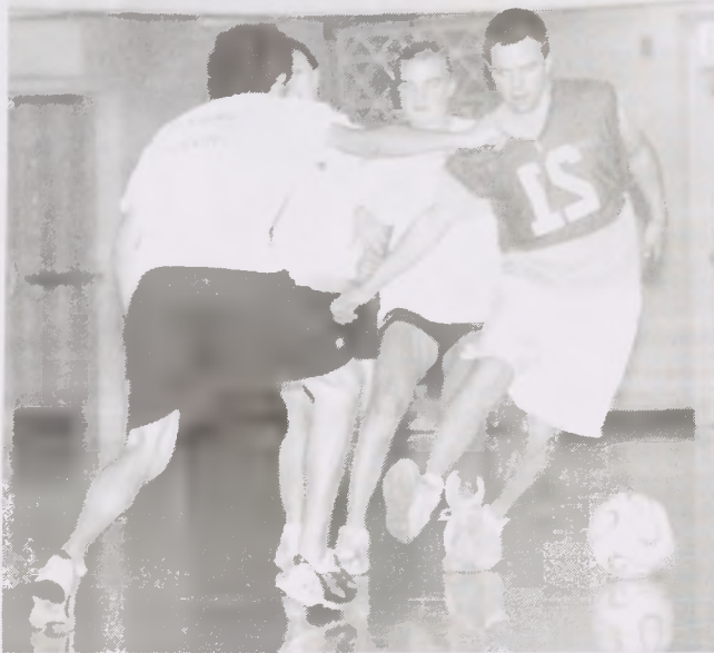
Due to its popularity this year, indoor soccer has a men's division and co-rec division.