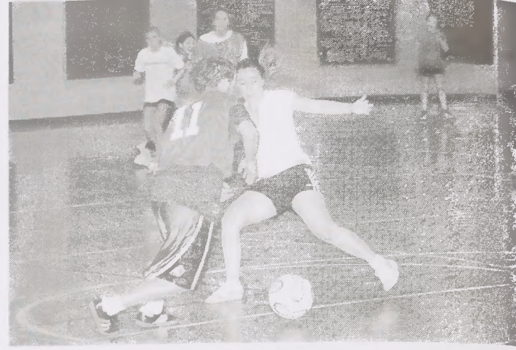
The indoor soccer regular season for both men's and co-rec ends on Nov. 18. The games will all be held in the health and fitness center.