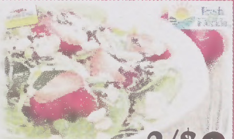
FLORIDA STRAWBERRIES 1 Lb. SAVE 4.92 ON 2