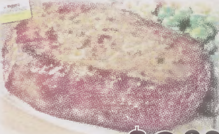
BONELESS PORK CHOPS Family Pack SAVE 2.00 Lb.