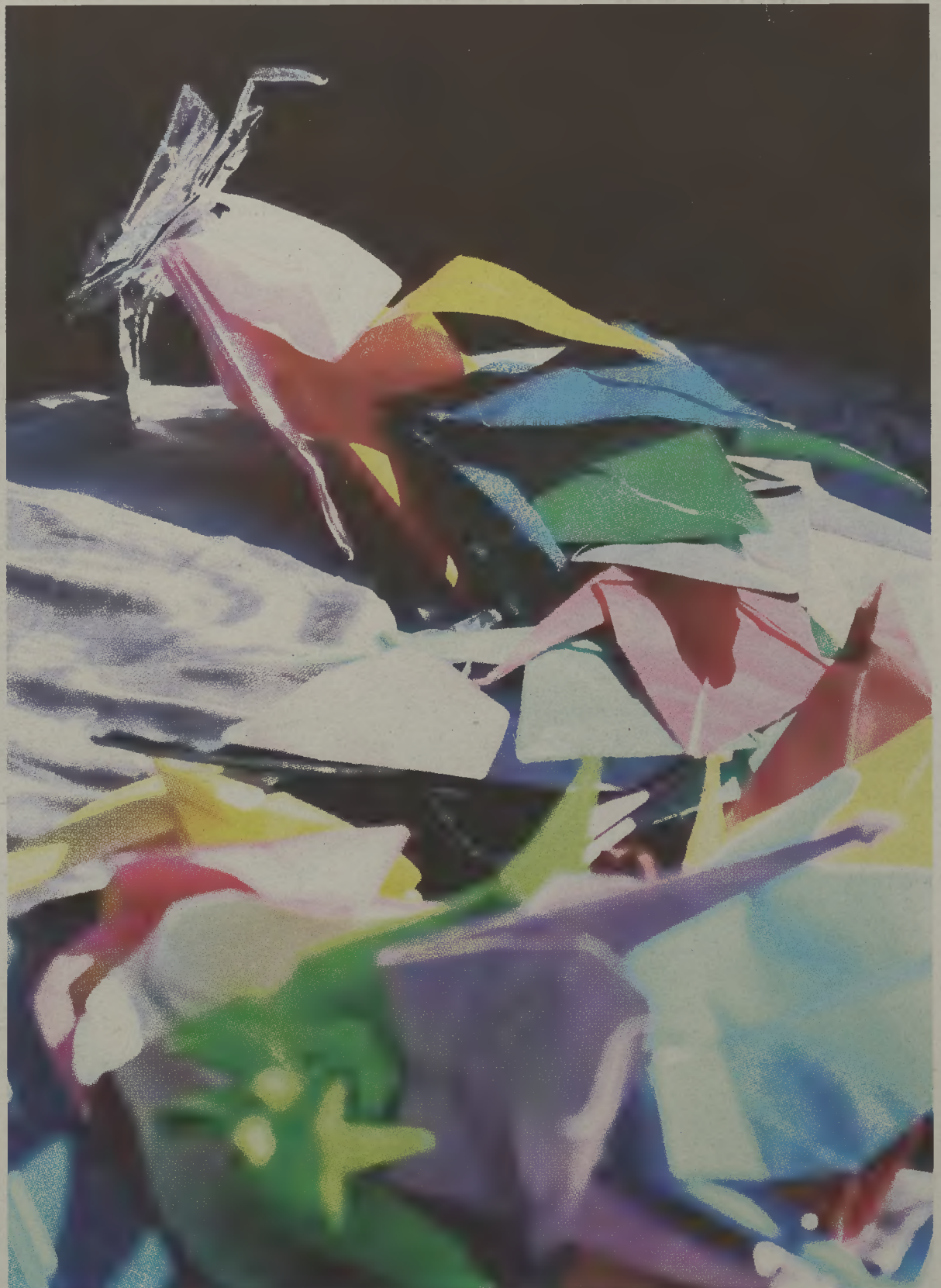
Origami swans created by students are displayed on a table in the Highsmith Plaza.