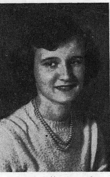
Secretary-Treasurer of Student Council