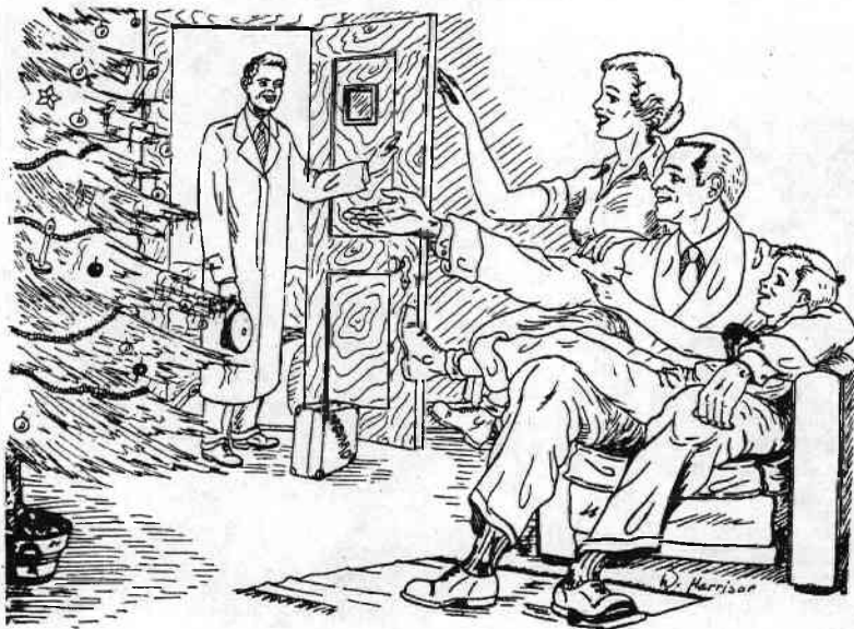
One week from today!