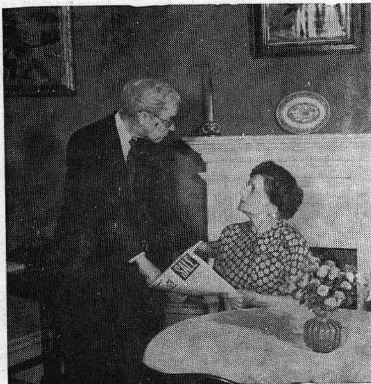
The Bean boom is on and Dr. and Mrs. Haggett suddenly discover that they have used the paintings of "The Late Christopher Bean" to stop leaks in the attic and to make a roof for the chicken coop. The laughs start early in this delightful comedy by the Barter Theatre of Virginia, which was presented Tuesday night to a large audience here in the Brevard college gym.