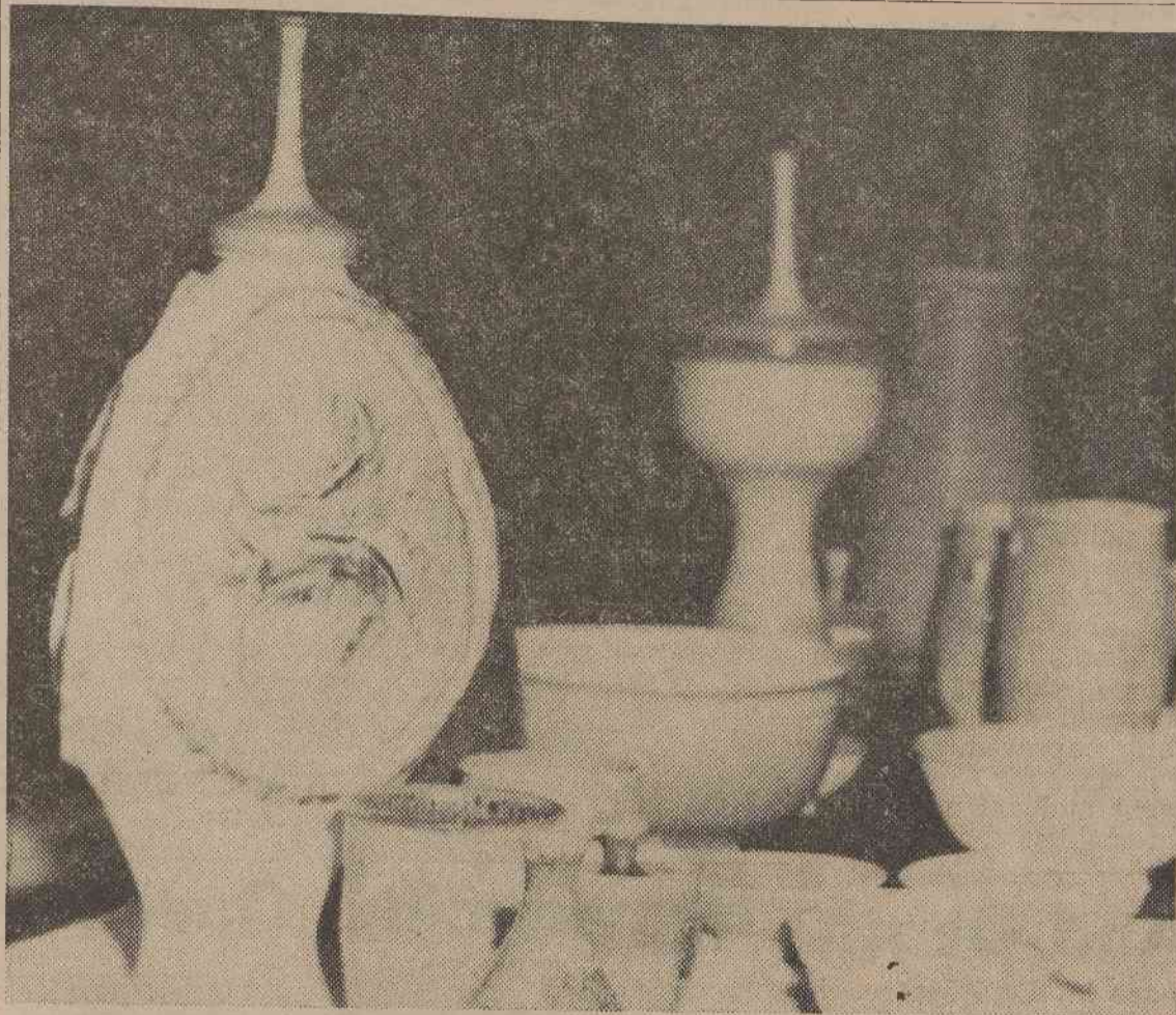
NO ODES on these urns — part of the art exchange program between faculty members of Brevard and Asheville - Biltmore, they are for sale.

Eugene Bonelli of the NASM visited the Music Department of Brevard College in order to evaluate it in accordance with the standards of the NASM.