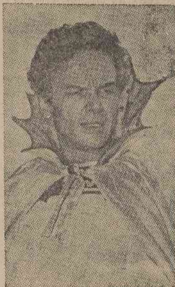
'THE TEMPEST' — by the American Classical Theater.