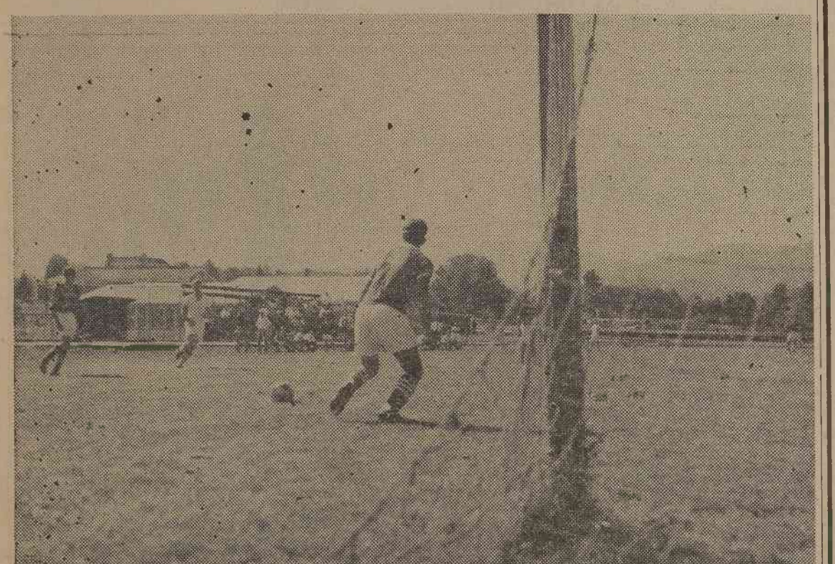
KICK IT OUT! Brevard's Soccer team worked hard as they play-