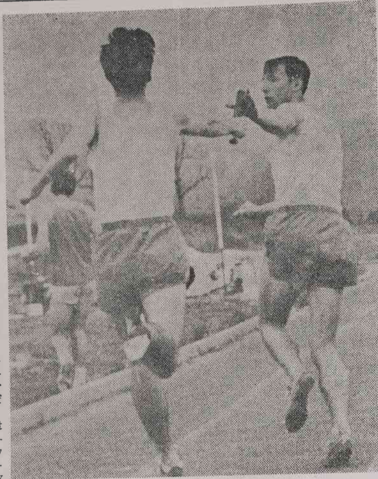
"Keeping Up With The Joneses"