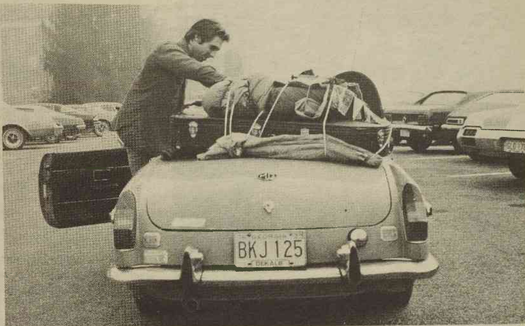
Fonzie look-alike moves in at Brevard