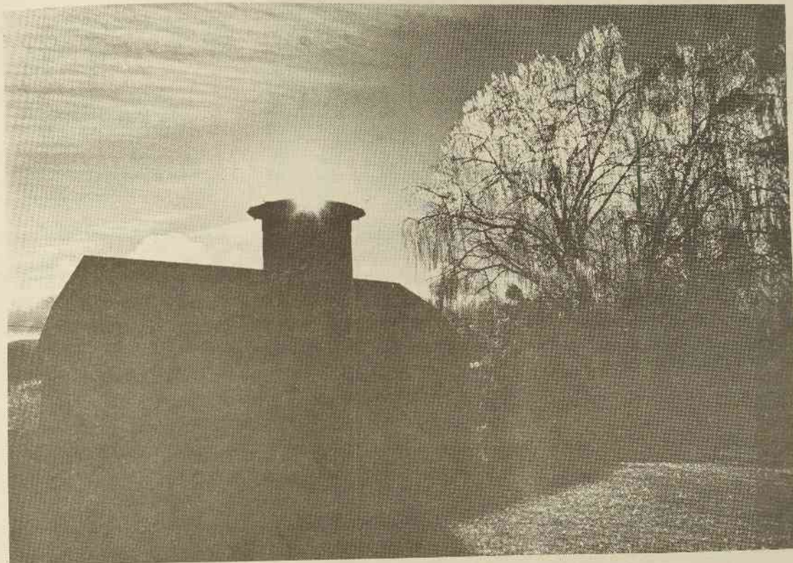
The sunlight, trees, and barn theatre blend into incredible beauty.