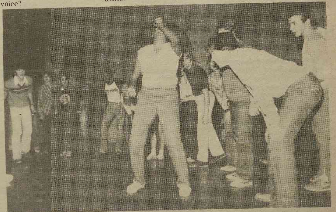
Members of the cast of Once Upon A Mattress practice during an early rehearsal.

A good faculty, coupled with a good system and fine students make Brevard the right place to be.