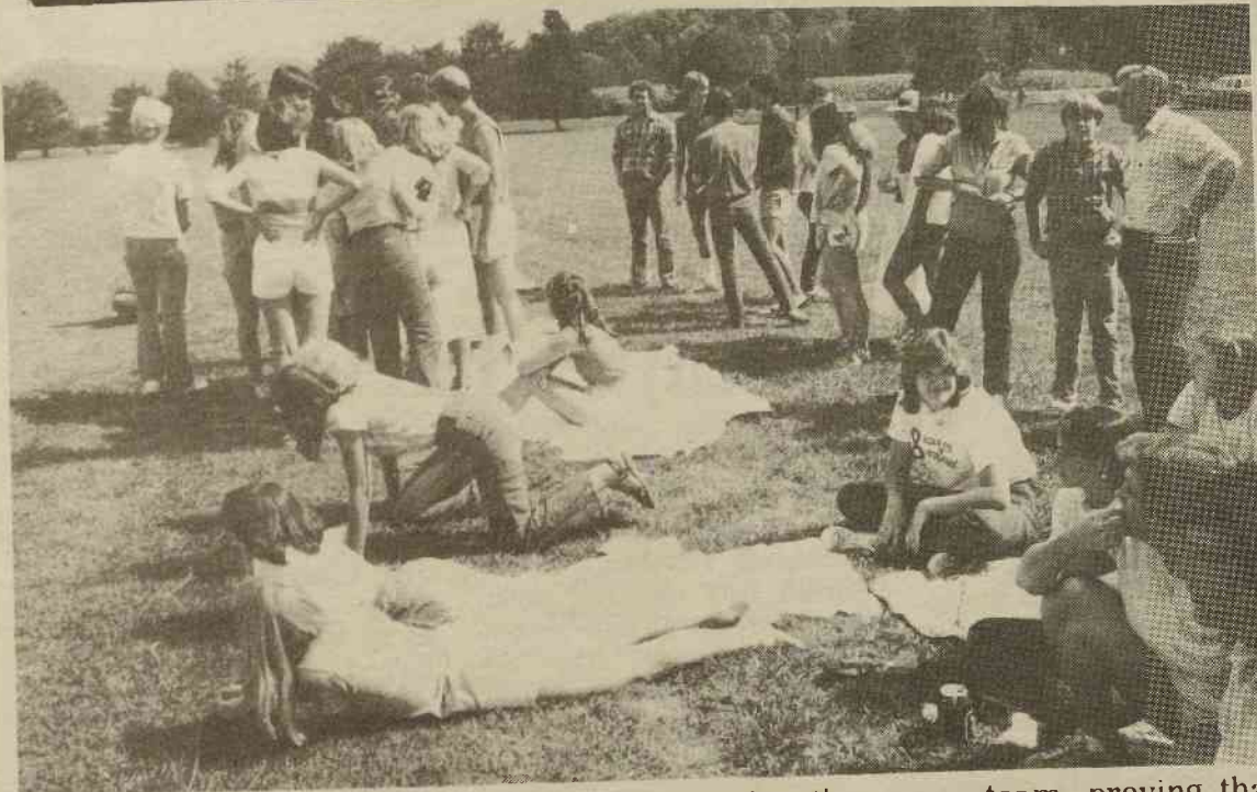
Students show their "togetherness" by supporting the soccer team, proving that Brevard is the right place to be.