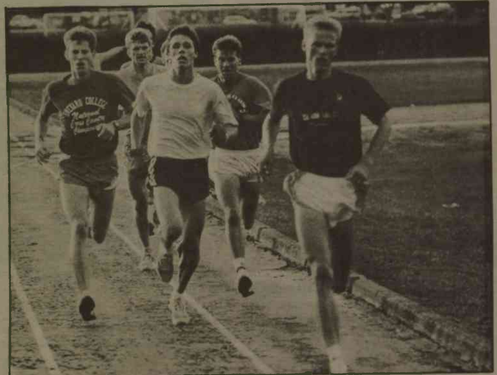
BC runners working out in preparation for more competition this winter and spring.

After the N.C. State Twilight Meet in Raleigh, the best runners go to Odessa, Texas, for the NJCAA Outdoor Track Championships, May 19-20.