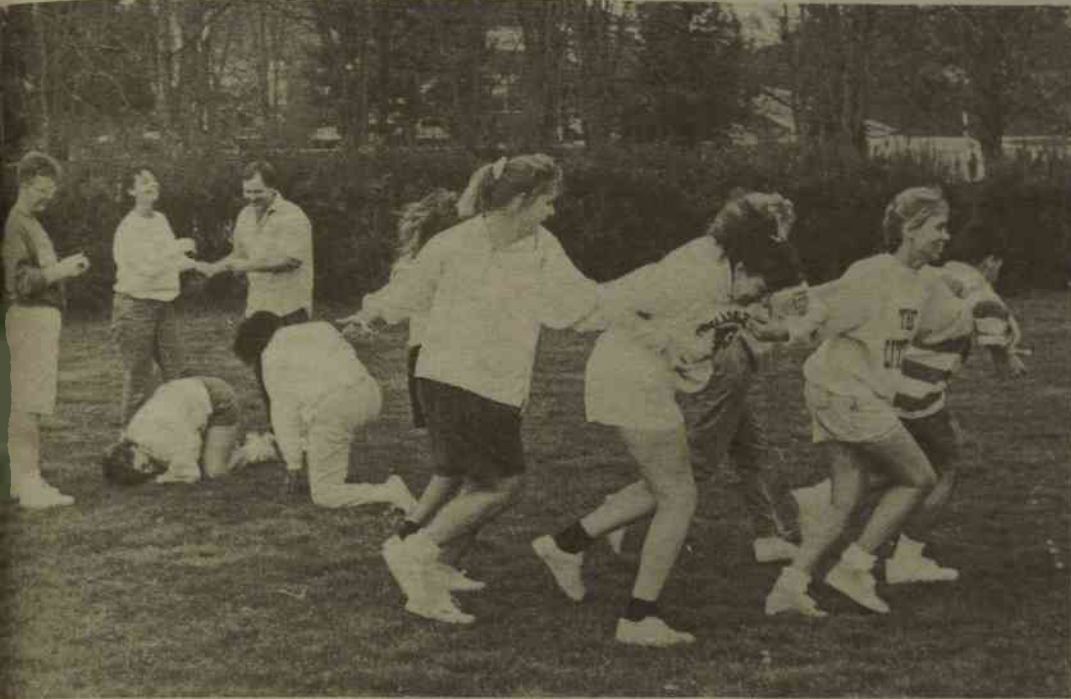
land is down on all fours during the human-chain relay.