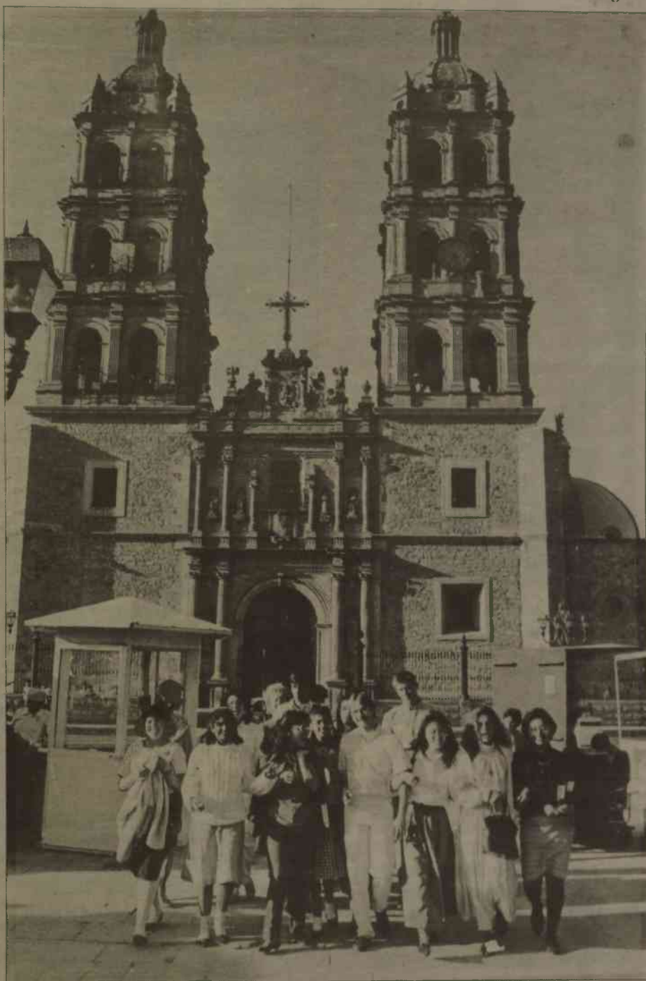
BC students from spring break '89 walk through the central square of Durango. The College is planning a return trip to Mexico this summer and students may still sign up for the June language study trip.