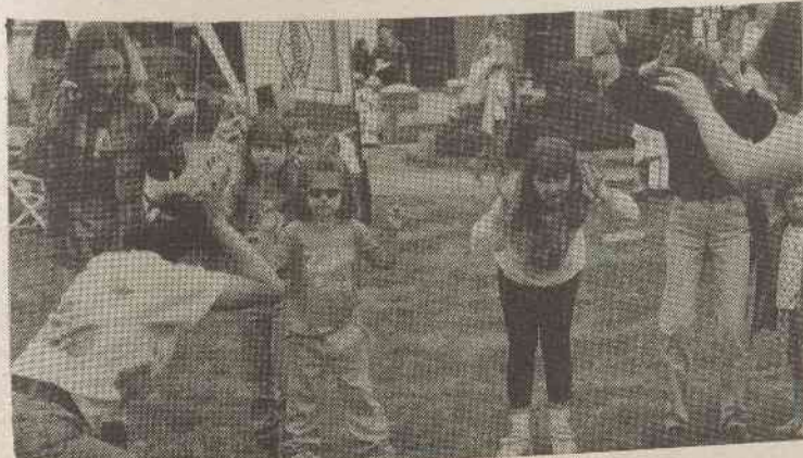
Children enjoy earth games at the Earth day celebration.

The excitement began on Saturday, April 13 with Springfest '96. A variety