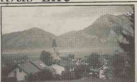
The 1998 Spring Semester in Austria Approaching its Departure