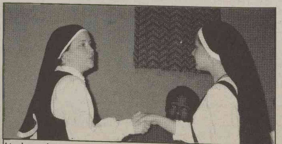
At a dress rehearsal...