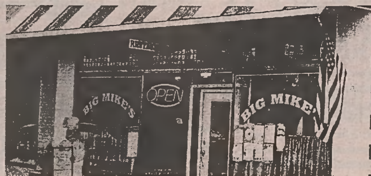
-Big Mike's pizza parlor. Photo by Michael Cohen-

From the reaction of the audience at this concert it seems that almost anyone who likes rock would enjoy this show. If Tool comes back in your area, be sure to check them out.