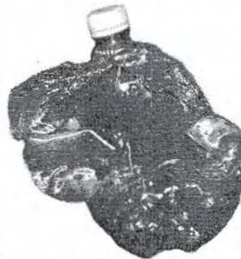
Primitive bomb found on campus