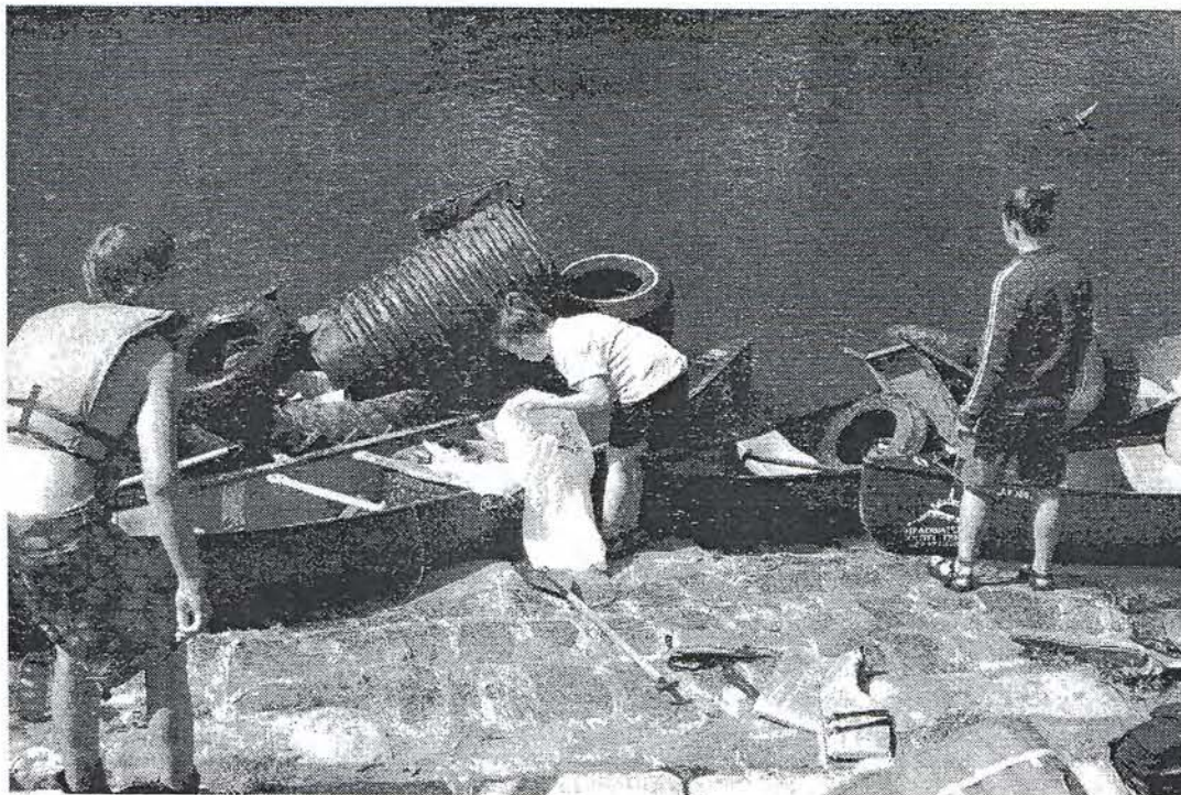
Students remove trash from the French Broad River