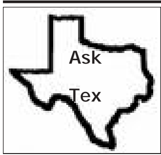
Dear Tex. What is the proper way to go about shotgun fishing?

Well then, you should use only the finest gun shells. If I was you I would use slugs instead of bird shot. On Mythbusters they have proven that you can use a gun to kill fish with. The shot impacts the water and pushes it to about 4 feet and the force of the water crushes the fish and they die more humanely.