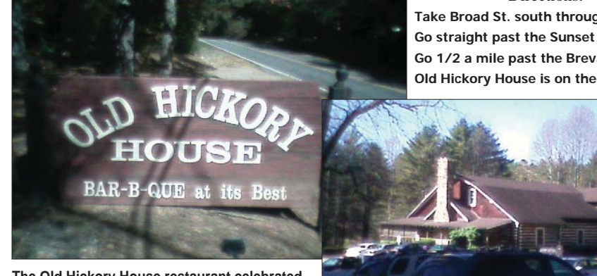
The Old Hickory House restaurant celebrated its grand re-opening on Tuesday.