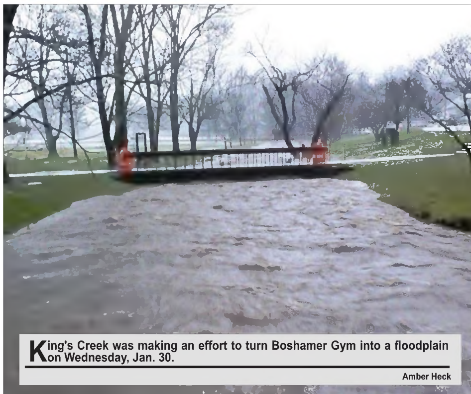
King's Creek was making an effort to turn Boshamer Gym into a floodplain on Wednesday, Jan. 30.