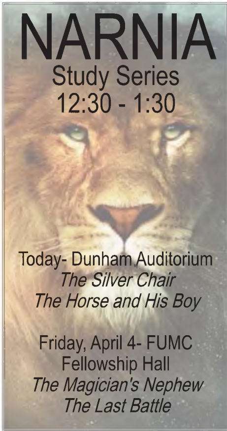
PHOTO OF THE WEEK