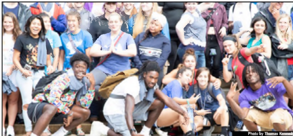
Freshmen pose in front of the J.A. Jones Library during this year's CREEK Week festivities.