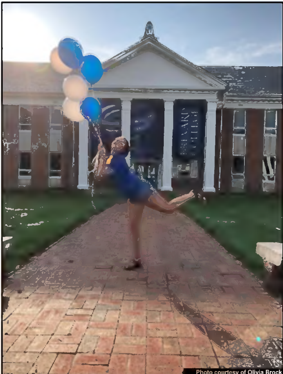
Welcoming new freshmen to the best four years of their lives.