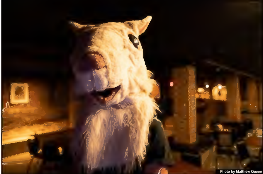
"This sums up my college experience."