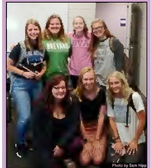
Seven members of Pastimes History Club pose for a photo during their first meeting.