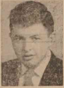
"A broad smile, A friendly 'Hello,' Sums the boy we all know."