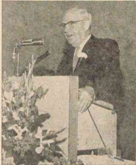
Governor Luther H. Hodges