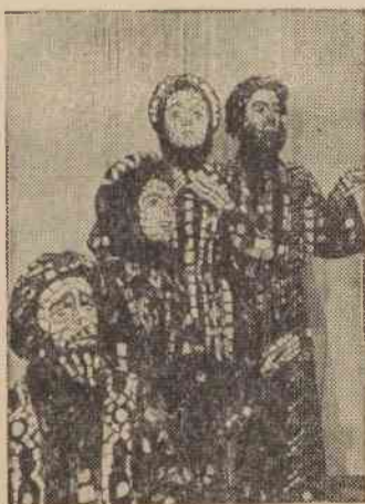
THE EVERYMAN PLAYERS

The play "The Book of Job" comes to Louisburg after four years of successful appearances. It opened at the Brussels World Fair in 1958 and afterwards toured Great Britain and Canada. New (See CONCERT SERIES on page 3)