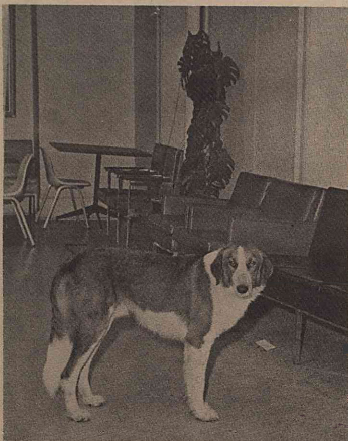
Apathy Reigneth - Go Louisburg! Finch photo