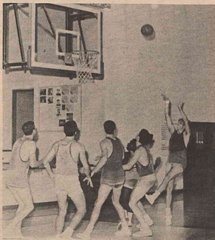
CANES IN PRACTICE