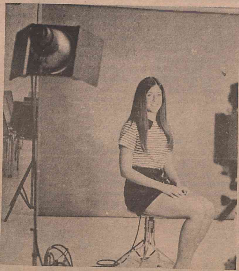
POSES FOR YEARBOOK PICTURE

Students have been able to look at their proofs in the Student Union for the past week. Pictures to be shown in the student section of the annual were chosen by the students.