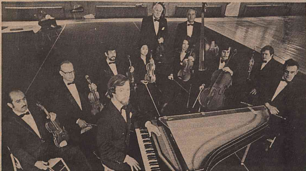
1972 CHAMBER PLAYERS