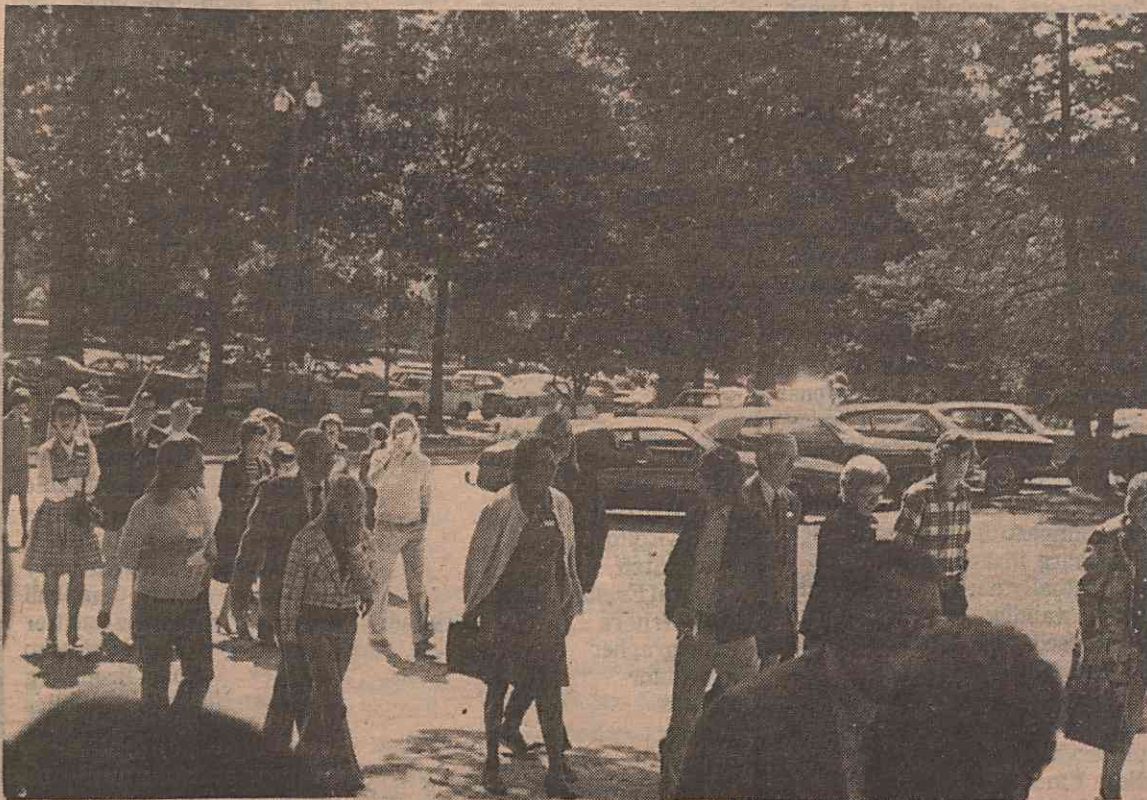
The Folks Are Here For Parents' Day 1974

The sophomore class had a fair turnout with 208 (64 percent) going to the polls. The freshman class was able to manage only a turnout of just over 49 percent, with 170 voting.