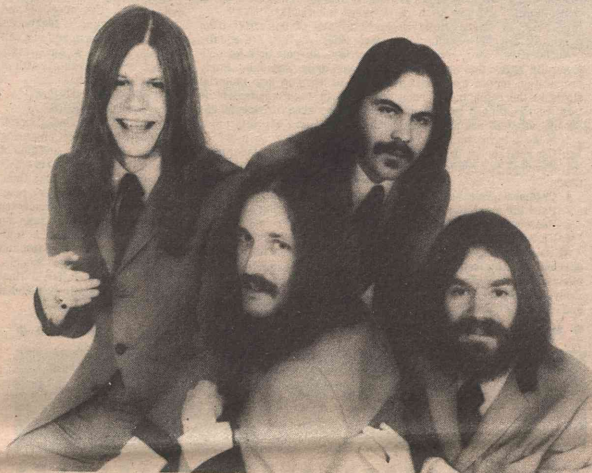
Liverpool To Appear Saturday Night In Concert