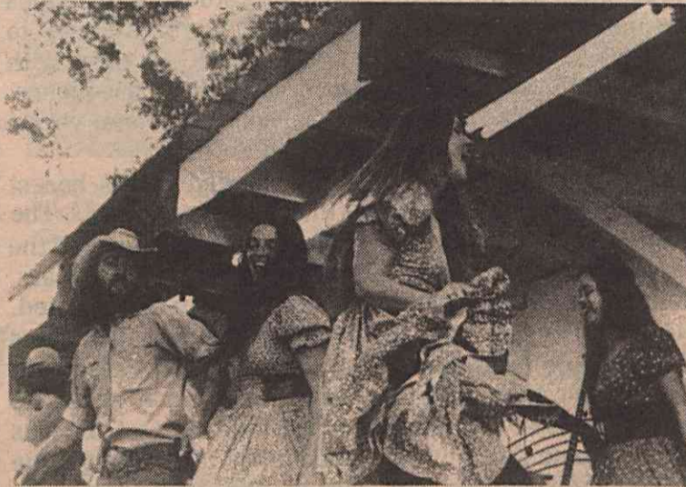
The Green Grass Cloggers

The production will include the following of Robert Browning's poems: My Last Duchess, The Bishop Orders His Tomb at St. Praxed's, The Pied Piper of Hamelin, Evelyn Hope, the