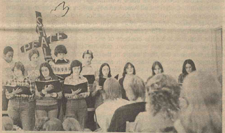
The Louisburg Ensemble sings at Chapel.

This ended the official Homecoming Weekend, sponsored by the SGA and the Entertainment Committee.